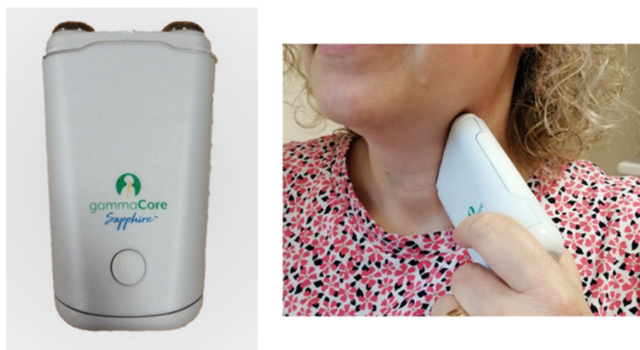
Fig. 1 ElectroCore's gammaCore nVNS device (left) and demonstrated use (right) with the device applied to the left side of the neck

The risk associated with the use of the gammaCore® nVNS device is minimal, and the safety profile is strong. The most common adverse events reported include local